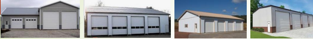
Possible Locations Pictures are roughly 56' x 40' buildings